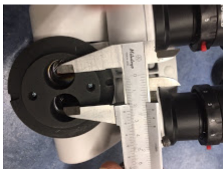
Prima DNT ergo head distance 160120.jpg 90K